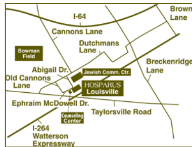
Hosparus-Louisville 3526 Ephraim McDowell Dr.

The Hosparus Grief Counseling Center services and programs are offered at no cost to Hosparus families for up to 13 months following the death. The cost for others is based on a sliding scale and includes financial assistance for those unable to pay, thanks to the generous support through grants from Community Foundation of Southern Indiana, Cralle Foundation, Gannett Foundation, Harrison County Community Foundation, Kosair Charities, IPA, Louise Duncan Head Foundation, Rite Aid, Shelby County Community Foundations, Sisters of Charity of Nazareth, Woosley Foundation and the WHAS Crusade for Children.