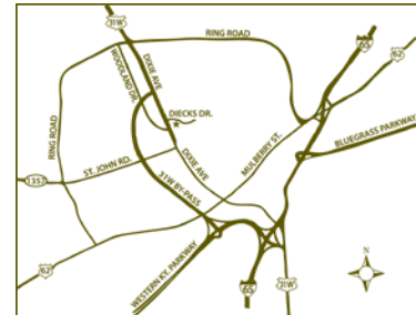
Hosparus-Central Kentucky 105 Diecks Dr, Elizabethtown