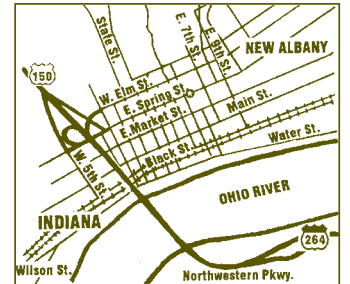
Hosparus-New Albany 612 E. Spring St.

LOSS SUPPORT GROUPS FOR ADULTS – Ongoing support groups offer a unique opportunity to meet and talk with others who've experienced loss, and to share strategies for coping. No pre-registration required and there is no fee.